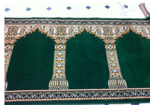
The new carpet in our Masjid

last two construction seasons, the IAS has spent over $600,000 to adapt the facility to our community needs. There are now two action items on our agenda