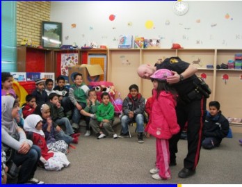
Saskatoon Police officer instructing the children at the Islamic Center