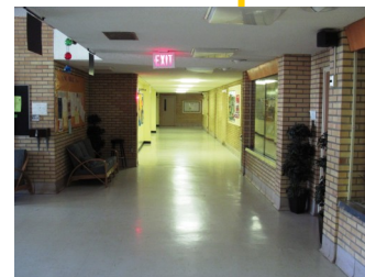
IAS is yours ! Get involved.